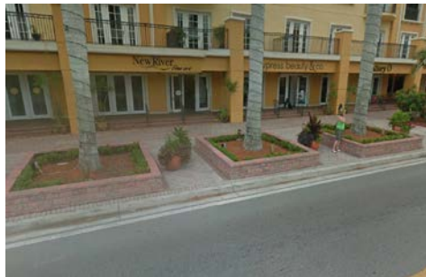
Planter wall at 5 th Ave S & 6 th St S and on both Gordon River Bridges (both walls are same style): Hourly Rate for planter wall repair: $_____/hr

NOTE: If City has materials available, Paver contractor shall transport/deliver and/or pick up from the City of Naples stock yard (Fleischmann Blvd & 10 th St N or Riverside Circle at no additional charge).