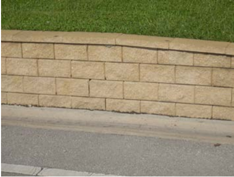
Hourly Rate for retaining wall repair: $_____/hr Retaining wall at Crayton Road & Whispering Pine Lane

The prices below shall include equipment, tools, labor and all setting materials necessary to complete damaged wall or planter. Wall materials supplied by City of Naples, property owner or per material price list below.