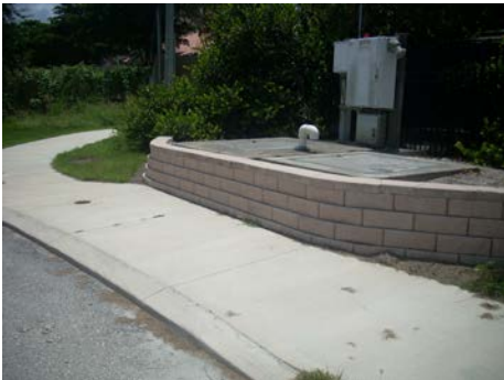
Hourly Rate for retaining wall repair: $_____/hr Retaining wall at easterly terminus of 3 rd Avenue North (same style wall also found at Diana Ave & 13 th St N)